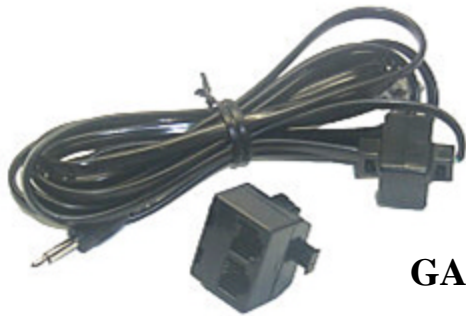
GA23 Telephone Recording Device

The Telephone Recording Device is simple to use. A two way socket is provided so that the Telephone Recording Device can be plugged into the same outlet as your phone. The other end of the Telephone Recording Device plugs into the microphone jack of any standard tape recorder. No batteries are required. Instructions with illustrations are included.