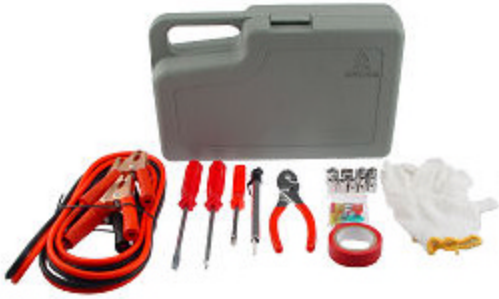
GA16 Emergency Road Kit

A 31 piece Roadside Emergency Kit is an ideal gift for someone who travels at night or in dangerous weather.